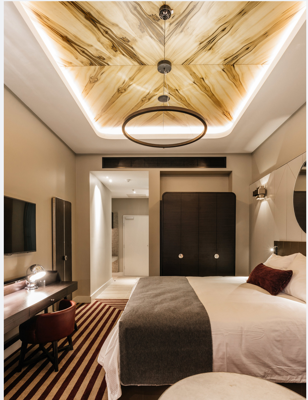
The Tasman, a luxury collection hotel - Art Deco room