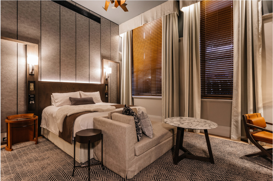
[01] The Tasman, a luxury collection hotel - Art Deco bathroom. [02] The Tasman, a luxury collection hotel - Heritage bathroom. [03] The Tasman, a luxury collection hotel - Heritage room